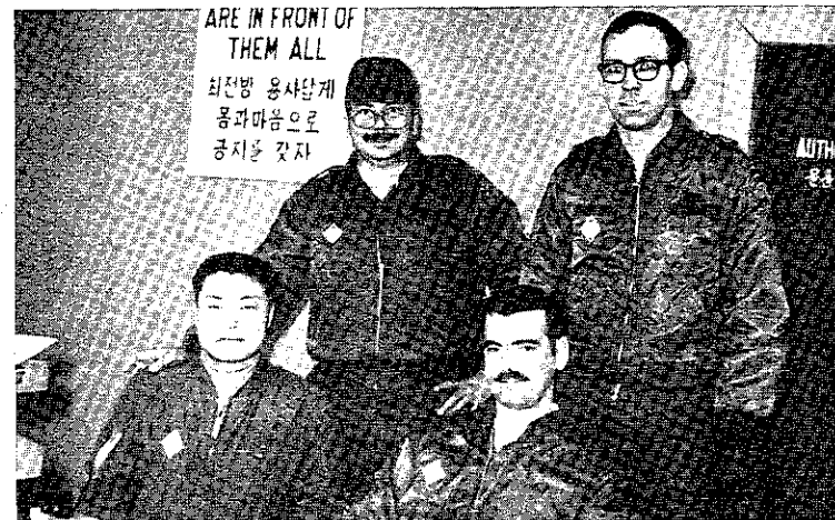
It might have been a good picture "Sir"