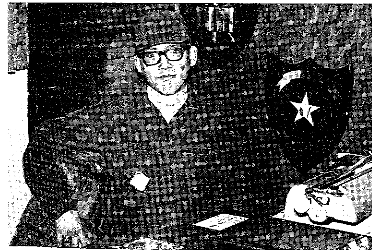
Boy! Boy! Boy!