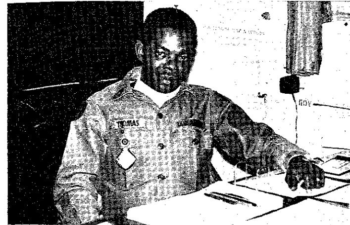
Whom! I am tired