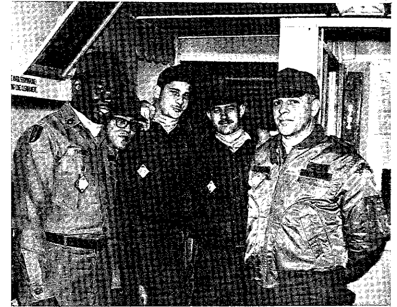
Look sharp the boss