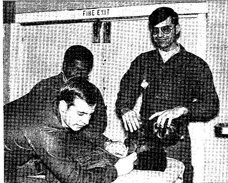
Another hard day at work(?)