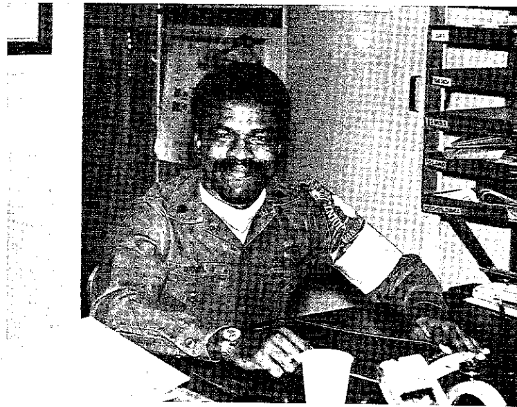
What's so funny