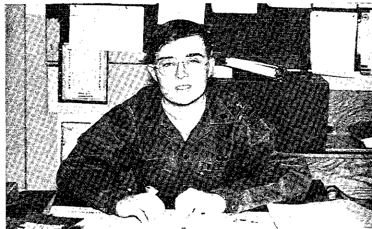
Avast Ya swabbies! Ya'll walk the Flank