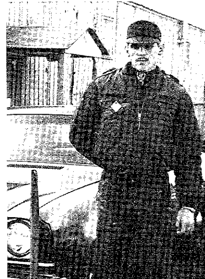
It's broke down again Sir!