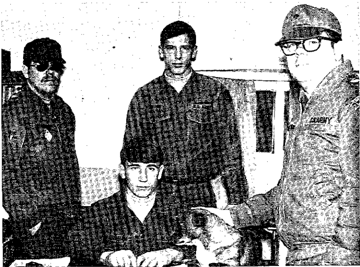
Rangers sitting in for Danny Day.