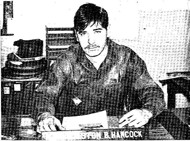
That's a negatory big Ben!